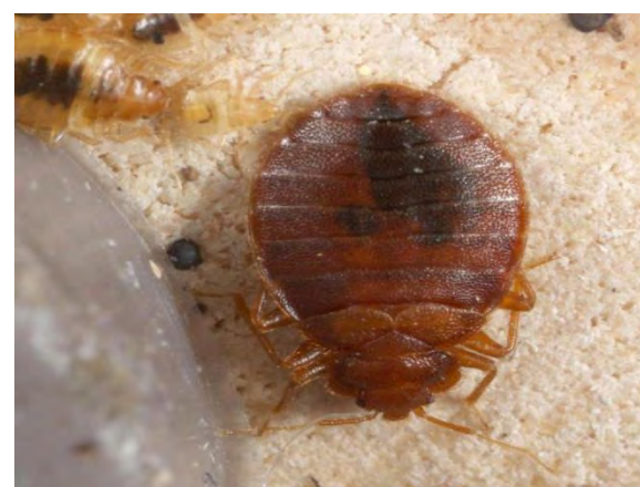
Bed bug nymphs.

Bed bugs tend to group in dark enclosed areas to rest between feeding events. These aggregation sites may be indicated by spotting produced by bed bug excrement, oval cream colored eggs, old skins from molted bed bugs as well as various active life stages.