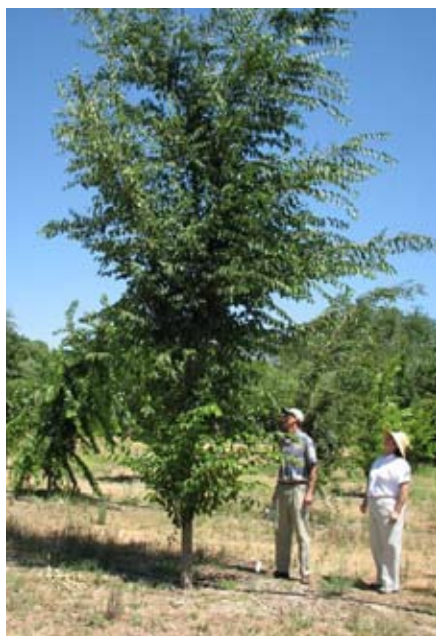
Figure 1. An Emerald Sunshine tree, one of the slower growing cultivars, seen in the UC Davis plot June, 2008.

bare root stock from J.F. Schmidt & Son were planted May 5, 2005 (Table 1). Five trees from each of the 14 cultivars were planted, or 70 total. Trees were spaced every 20-ft. (6m) in a four-row random block design. The trees were planted into a relatively flat, sandy loam soil. Vertebrate chewing on bark was minimized by trunk guards. During the first year trees were irrigated from a single drip emitter. They received approximately 13 gallons per tree twice a week during the summer, and reduced amounts during spring and fall. The trees received no irrigation from November through March, although weather