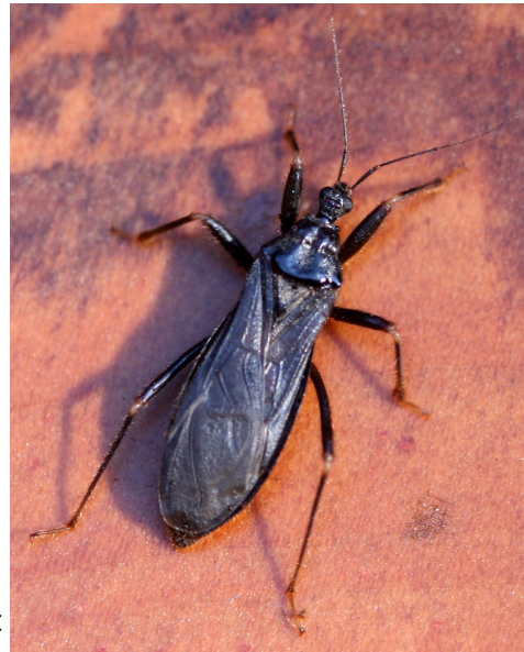
Adult masked hunter