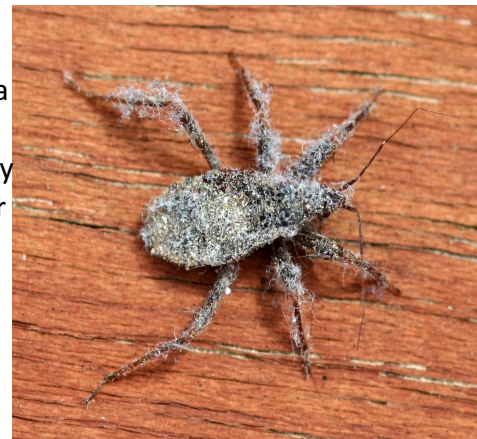
Masked hunter nymph covered with lint